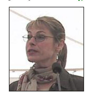
Issue 31 • Page 25